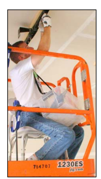
Installing overhead lifts saved valuable workspace, while the Utilitote™ carrier kept tools in easy reach

Here are just a few of the things I considered when I sought to optimize my workspace. Time spent navigating through a maze of raw materials, work in progress and finished goods is time wasted. So I installed half a dozen overhead lifts so whatever items I may not be working with on a given day can be stowed up and out of my way. Likewise, unnecessary movement between office space and manufacturing space burns precious minutes. So I connected my color laser printer to my wireless network and moved it from my office to the shop floor. That way, documents like invoices and shipping labels get generated right where I need them. Finally, struggling to move component parts, like the five-foot aluminum Hound-a-bout masts as they come in from the vendor that anodizes them, would be a real time killer. So I made it a point to maintain large enough access points to the manufacturing workspace so I am able to easily move goods in and out on my lap, from my chair.